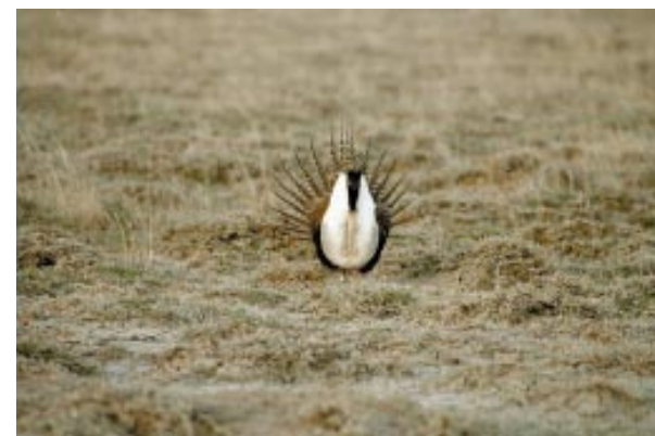
Male sage-grouse strutting on lek

"A Sage-grouse Recovery Action Group has been put together to develop best management practices that are most beneficial to sage-grouse, and then to understand how sage-grouse respond." Aldridge continues, "We know that we're looking at providing a mixture of land-