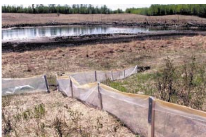
Amphibian pitfall traps at pond in pasture

For more information, contact Sara Eaves at seaves@ualberta.ca