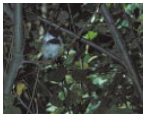
Black-capped chickadee

forest must be maintained to retain the most biodiversity, Hannon responded, "Woodlots of 100 hectares would contain most passerines and grouse, but much larger patches would be required for larger species such as raptors." She added, "Smaller woodlots, woodlots that have had spruce removed or harvested, and woodlots that have had cattle access all support less biodiversity. Narrower strips of forest, 100 metres wide or less, are prone to "edge effects," meaning that corvids (magpies and crows) can more easily penetrate the cover and prey on smaller species."