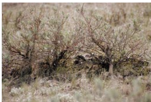
Sage-grouse hen on nest

Aldridge has been studying habitat use and selection at nest sites, brood-rearing locations, summer loafing sites and at overwintering areas in order to better understand the importance of elements such as nesting cover and food resources to the population. In particular, a better understanding of how habitat influences sage-grouse survival at each life stage is crucial to identifying remedies for the decline. Together, all of these data are being used by Aldridge to