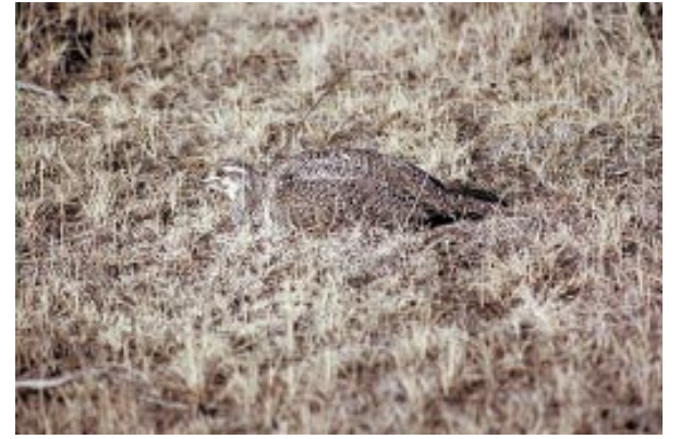
Sage-grouse hen with radio-collar