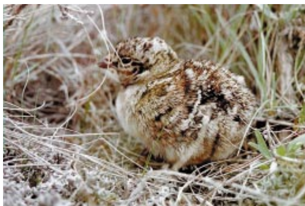
Sage-grouse chick, two days old

Using his model, Aldridge predicted that the number of male sage-grouse attending leks, or strutting grounds in the spring, would decrease from the 140 observed in 1999 to an estimate of about 113 in 2002. However, when the time came, he was only able to count 97 males on leks in 2002. Continued drought conditions may