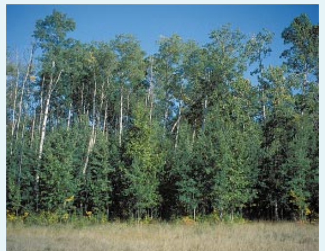
Aspen forest cover

were identified across a gradient of landscapes representing those that were relatively undisturbed by human use to those that have been highly impacted (e.g. cropland, cattle grazing, roads). Fifty, 100-hectare landscapes ranging from 3.5 to 89% forest cover were surveyed for smaller birds and 50, 1,500-hectare landscapes were surveyed for owls. Factors that may influence reproductive success, such as food availability and predation pressure, were also identified. The intent was to pinpoint "critical thresholds" of forest cover and forest configuration for each of the species sampled.