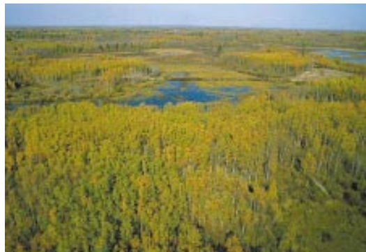
Alberta's aspen parkland

Bjorge describes three main uses for his data. Ongoing or new land stewardship programs will be able to quickly identify conservation priorities and whether these fall within public or private lands. Integrated conservation strategies, such as