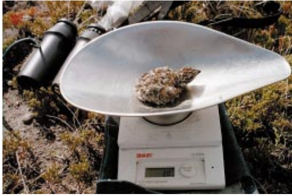
Weighing sage-grouse chick

cumulative effects of many habitat pressures over time. The growth of industry and agriculture within the sage-grouse's range and the persistent drought through the last couple of decades have left their marks. With any population at low numbers, disastrous weather conditions such as those experienced during the spring of 2002, can have large impacts on population numbers. Even seemingly innocuous power lines can, unfortunately, play a deadly role, as sage-grouse are killed flying into the lines and